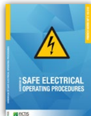
Handbook of safe electrical operating procedures