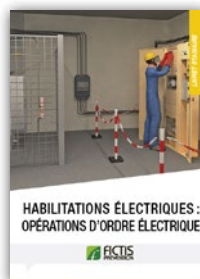
Handbook of electrical certifications: electrical operations