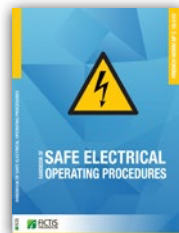
Handbook of safe electrical operating procedures